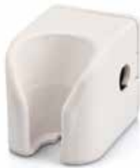
Cavity Holder Micro Motor