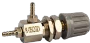
Flow / Water Control ( Switch - H )