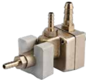
WRV / Pilot Valve - B