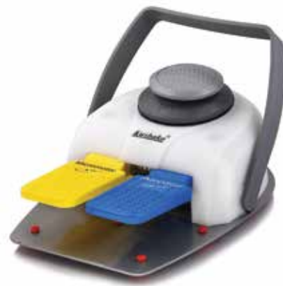
Foot Control with Joystick