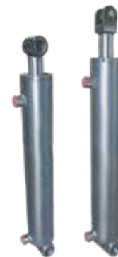
Hydraulic Cylinder (RAM)