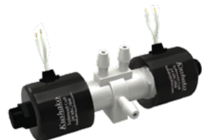
Twin Solenoid Valve 24 VAC/DC