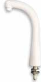
Big Tumbler Pipe A