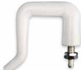
Tumbler Pipe Small - B