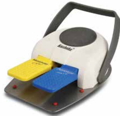
Foot Control Non-Joystick