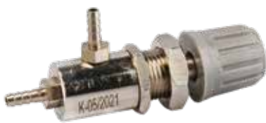
Flow / Water Control ( Switch - R )