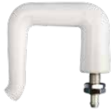
Tumbler Pipe Small - A