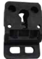
Cavity Holder / Hanger Valve Stand