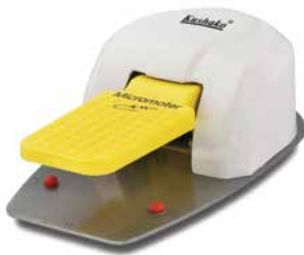
Foot Control Micro Motor