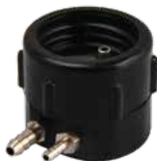
Bottle Cap Plastic