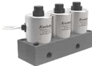
ALU Hard Anodised - 3 Combine