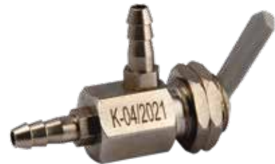
Air ON / OFF Switch - ( H )