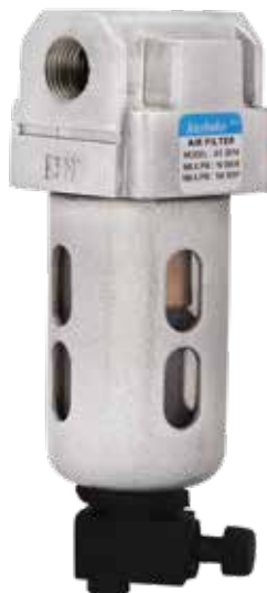
AF 2014 Bowl Guard/ Push Drain