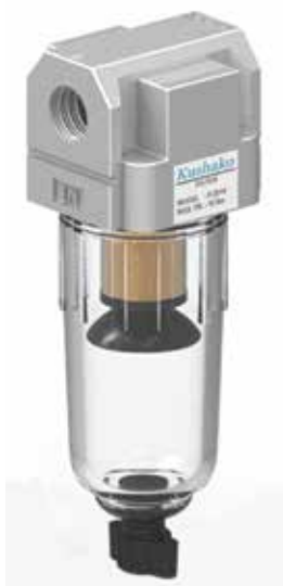
AF 2012 Eco Model