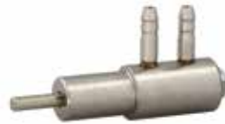
Cavity Holder / Hanger Valve