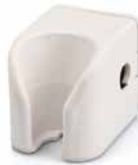
Cavity Holder Air Rotor