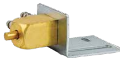
Foot Control Valve - B