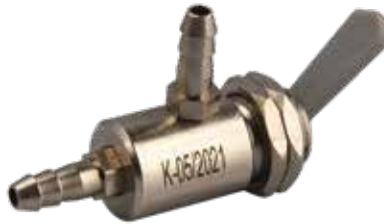
Air ON / OFF ( Switch - R )