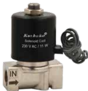
Air / Water Solenoid Valve