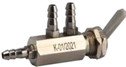
2 Way / 1-2 Selector Switch ( H )