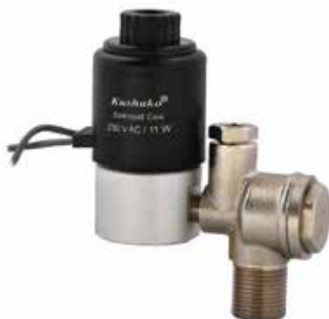
Compressor loading valve 3/8" with NRV - Mini