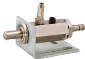
Foot Control Valve - A