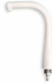
Big Tumbler Pipe BT