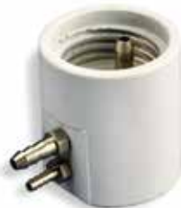
Bottle Cap Metal