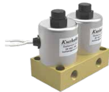
BRASS - 2 Combine Valve