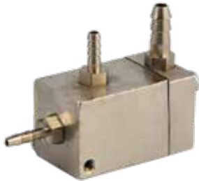
WRV / Pilot Valve - A