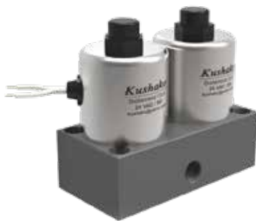
ALU - 2 Combine Valve