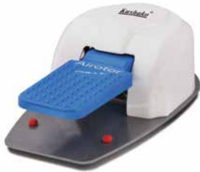
Foot Control Air Rotor