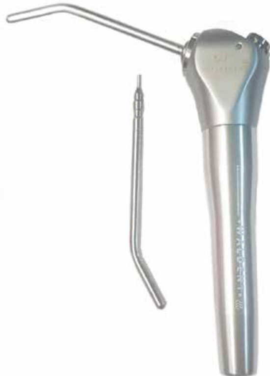
3 Way Syringe