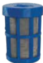
SS Wiremesh Filter