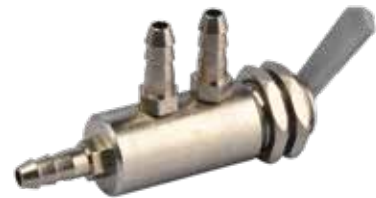
2 Way / 1-2 Selector Switch ( R )