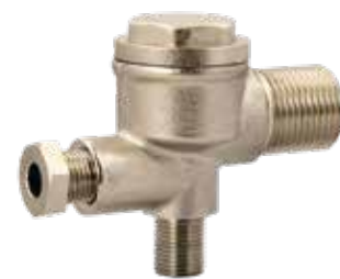
NRV 3/8 and 1/2"