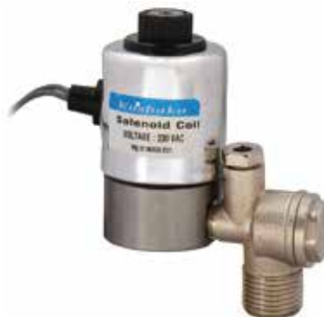
Compressor loading valve 1/2" with NRV - Standard