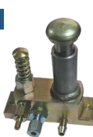
Pump Plate Assembly