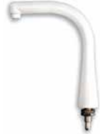
Big Tumbler Pipe CP